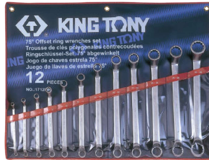
► MR / SR : Nylon pouch bag