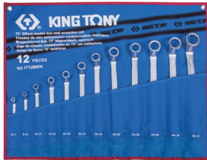
► MRN / SRN : Teton pouch bag