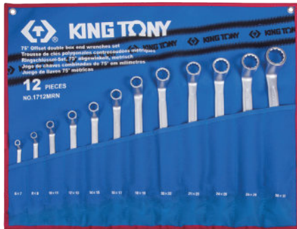
► MRN / SRN : Teton pouch bag