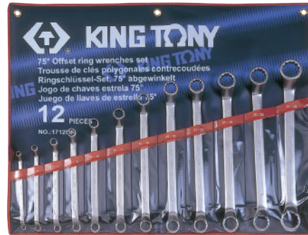
► MR / SR : Nylon pouch bag