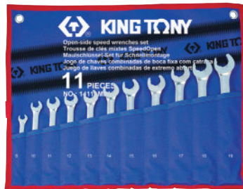
► Teton pouch bag