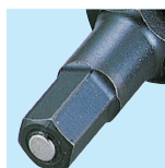
The magnet part