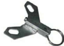
Option: PLUNGER Directional-Lock