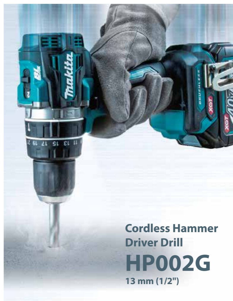
Cordless Hammer Driver Drill HP002G 13 mm (1/2")