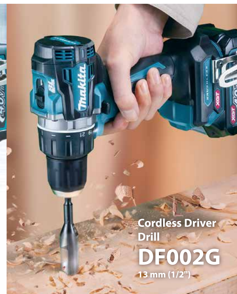
Cordless Driver Drill DF002G 13 mm (1/2")