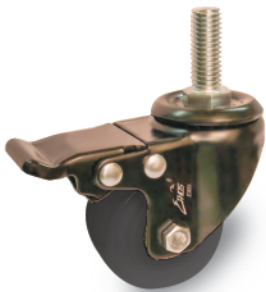
Threaded Stem with Total-Brake

Remarks: T13 = 1/2" - 20 UNF x 30mm available by indent basis only