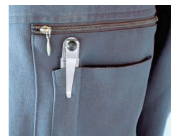
With pocket clip, easy to carry