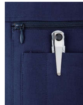
With pocket clip, easy to carry