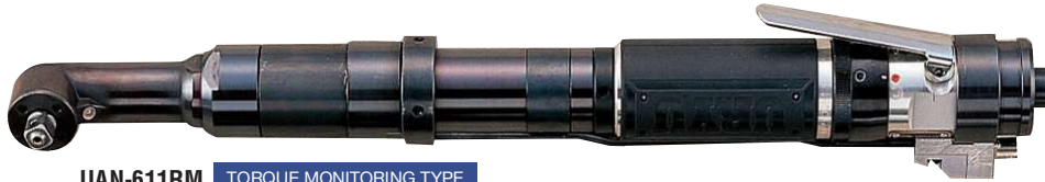
UAN-611RM TORQUE MONITORING TYPE

Instant automatic shut-off providing reduced reaction. Low inertia design providing increased accuracy.