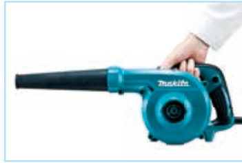
Grip for fatigueless operation