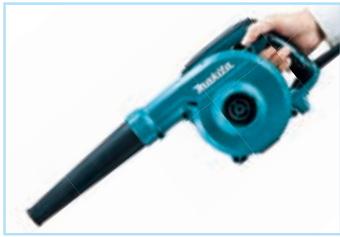
Optimum grip for downward applications

fits your hand perfectly to provide maximum comfort and control with less fatigue as illustrated below.