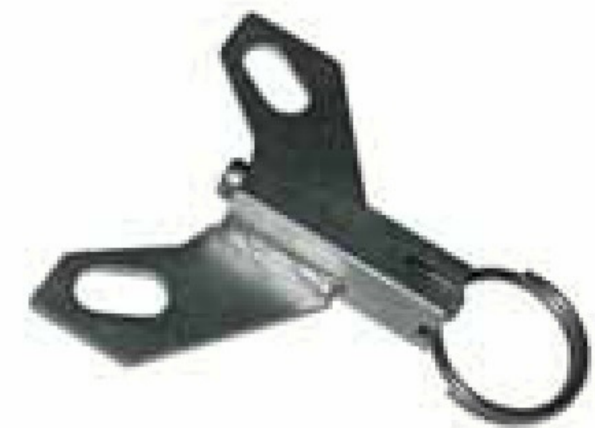
Option: PLUNGER Directional-Lock