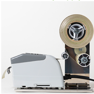
ZCUT-9GRRP ▶ Cut a tape with backing paper while removing it.